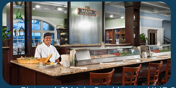
Pictured: 21 Main Steakhouse, NMB,SC